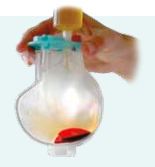
The platelet-poor plasma is decanted off, leaving the PRP pellet, which can now be re-suspended and extracted for use