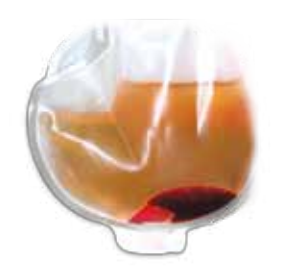
After the second centrifugation, the bag now contains platelet-poor plasma (PPP) as a supernatant and a pellet of platelet-rich plasma (PRP)