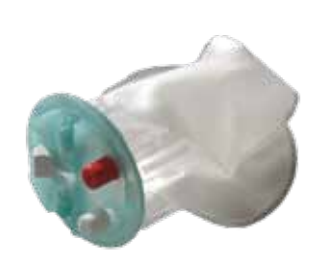
The empty Osteokine bag